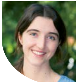
Doctor of Philosophy (Medicine) graduate

In this role I apply the scientific knowledge I gained during my PhD and postdoctoral training to drafting of patent specifications, prosecuting patent applications and providing freedom to operate advice in the biotechnology and pharmaceutical areas. The knowledge I gained during my PhD is essential for understanding and interpreting the technology I encounter in my current role."