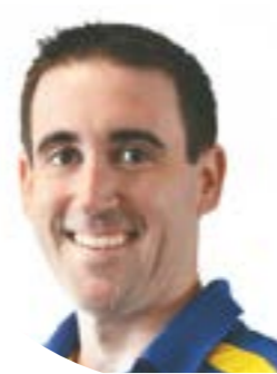
Doctor of Philosophy (Biomechanics) graduate

"My research career began with a stroke of luck in high school. In grade 11, I took part in the Australian Brain Bee Challenge, a neuroscience competition for high school students. As a state finalist, I was invited to complete a small research project at the Queensland Brain Institute (QBI). I became captivated by the neuroscience and felt compelled to continue my project as a higher degree by research. The Clinician Scientist Track was the perfect avenue to pursue my passion for research while completing my medical degree. The intercalated program is challenging and at times felt like an impossible exercise in time management. However, I would recommend it to any medical student with a serious interest in research. It has been very rewarding, and is a unique chance to pursue research and develop the associated skill set while in medical school."