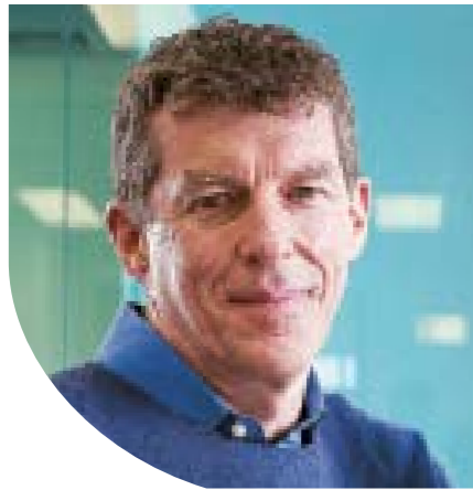
Professor Ian Frazer

Faculty of Medicine researchers.uq.edu.au/researcher/228