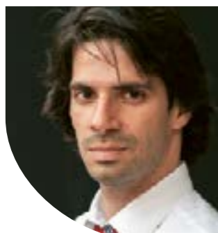
Doctor of Philosophy (infections and immunity) graduate

I believe my PhD has equipped me with the skills, knowledge and 'guts' to be able to do that."