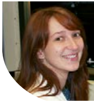
Doctor of Philosophy (Molecular and Cell Biology) graduate

With unrivalled research expertise and an international reputation for excellence, UQ provides every advantage to succeed during your Doctor of Philosophy (PhD) or Master of Philosophy (MPhil). Our bright minds come from all walks of life, with expertise in all aspects of health.