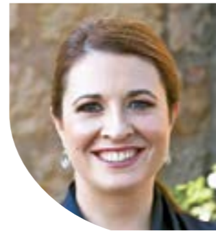
Doctor of Philosophy (Occupational Therapy) graduate

In 10 years time I hope to be in a continuing academic position at a major university. I hope to be leading my own research team and laboratory that develops high-quality research and is successful in attracting research funding."